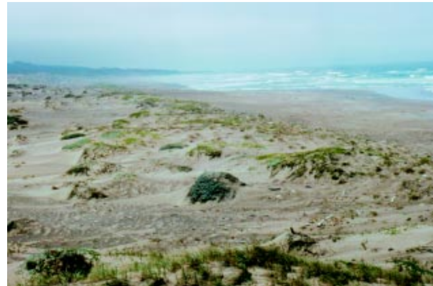
Plover habitat at Montaña de Oro State Park

and during that time the female may hatch more than one brood with different males. The nests are simple scrapes in the sand with 1-3 eggs that the male warms at night, while the female does day duty. Eggs hatch in about 27 days, and within hours the chicks are searching for their food of insects and other beach invertebrates. The chicks are on their own in 30 days. But surviving those two months is the trick.